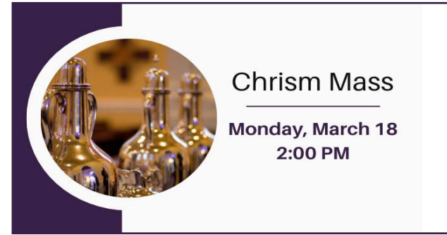
Chrism Mass Monday, March 18 at 2:00 PM at Holy Rosary Cathedral.

thinkingfaith.libsyn.com/restoring-a-first-nationsperspective-on-treaty-and-natural-resource-rights-part-2