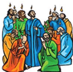
They were all filled with the Holy Spirit ... Acts 2:14, ESV